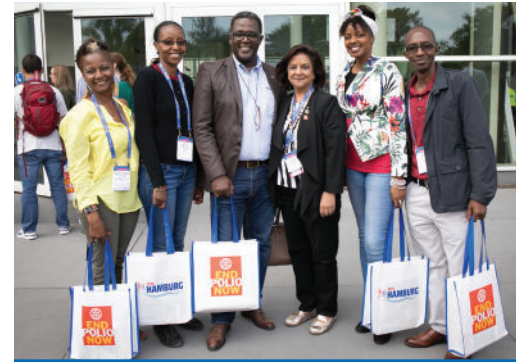
Attendees at the Rotary International Convention in 2019

The first Rotary Convention was held in Chicago, Illinois, USA, in August 1910.