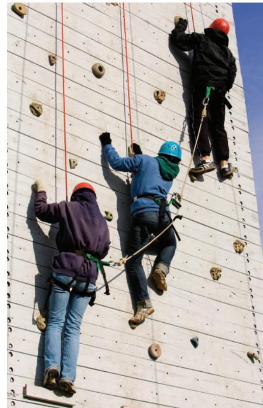
RYLA events instill values of service and leadership.

Each year, thousands of young people are selected to attend club-, district-, or multidistrict-sponsored leadership camps or seminars through Rotary Youth Leadership Awards (RYLA). In an informal atmosphere, participants spend several days in a challenging program of leadership training, facilitated discussions, inspirational addresses, and social activities designed to enhance their personal development, leadership skills, and good citizenship. Each RYLA program or event is customized to the participants' age range.