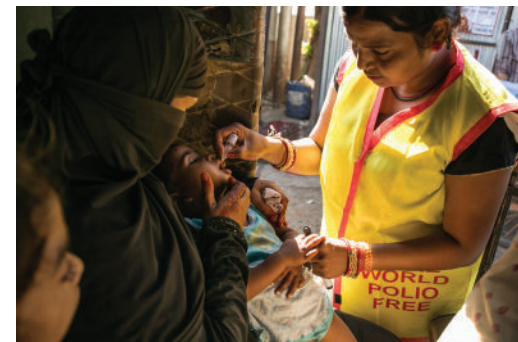
A Rotarian administers the polio vaccine.

Our members’ and others’ contributions to the Foundation allow us to bring sustainable change to communities in need. Ask your club’s Rotary Foundation expert or visit rotary.org/donate to learn how you can support our Foundation. To learn more, download The Rotary Foundation Reference Guide or take the Rotary Foundation Basics course in Rotary’s Learning Center .