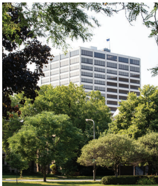
Rotary International World Headquarters in Evanston, Illinois, USA

Rotary International is administered by the Secretariat, which comprises more than 800 employees. Rotary's world headquarters is in Evanston, Illinois, USA, in a building called One Rotary Center. It has a 190-seat auditorium, Rotary's archives, and an executive suite with conference rooms for the RI Board of Directors and Rotary Foundation Trustees and the offices of the RI president and other senior officers. It also features a replica of Room 711, the site of the first Rotary club meeting.