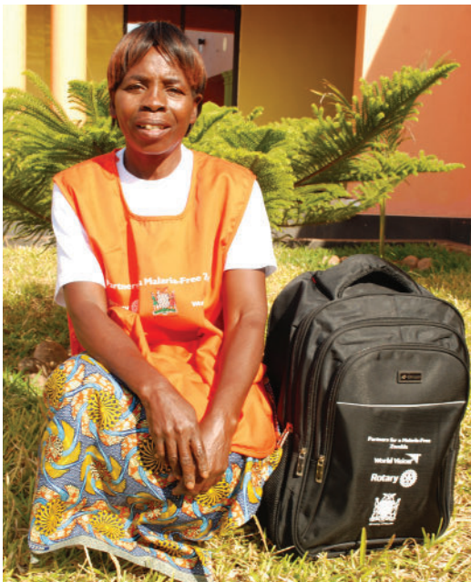
One of the women trained to be a public health worker in Zambia supported by the first Programs of Scale grant

Programs of Scale grants build on the scope, impact, and sustainability of successful Rotary service projects in our areas of focus. They empower Rotary members to work with experienced partners to implement large-scale, high-impact programs that address a critical need for large numbers of people across a significant geographic area. The Rotary Foundation awards one $2 million Programs of Scale grant each year to expand a member-led program over three to five years to create lasting change. Strong monitoring and evaluation systems measure impact, and the knowledge that is gained is shared with other clubs and districts to strengthen their local and international service. Visit rotary.org/programsofscale .