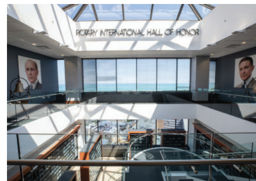
The Arch Klumph Society Gallery from the 18th floor of Rotary International World Headquarters

Club and District Support (CDS) representatives provide regionalized expertise to the clubs and districts they work with and guidance on Rotary's policies, procedures, resources, and tools. They often attend club and district meetings to meet with and train local Rotary leaders. Find your club's CDS representative at rotary.org/cds . You can also contact Rotary's Support Center at +1-847-866-3000 or rotarysupportcenter@rotary.org to ask questions about Rotary and its programs.