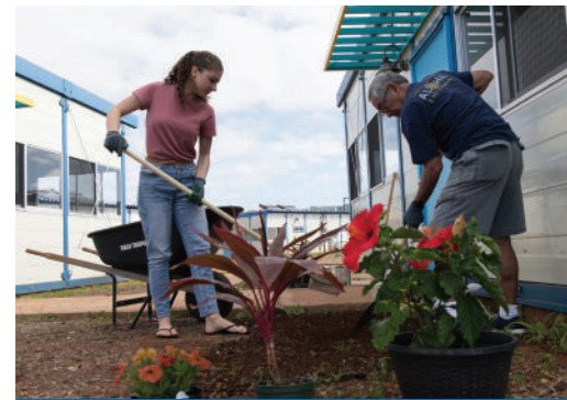
Rotary members and members of the community come together to serve.

A Rotary Community Corps (RCC) is a Rotary club-sponsored group of nonmembers who want to help their own community through service projects. Rotarians provide professional expertise, guidance, encouragement, organizational structure, and some material assistance to the RCC, whose members contribute their labor and knowledge of community needs. This community-based service program was initiated in 1986 to improve the quality of life in villages, neighborhoods, and other communities.